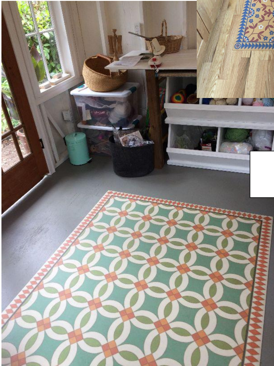
Wedding Ring Adelaide